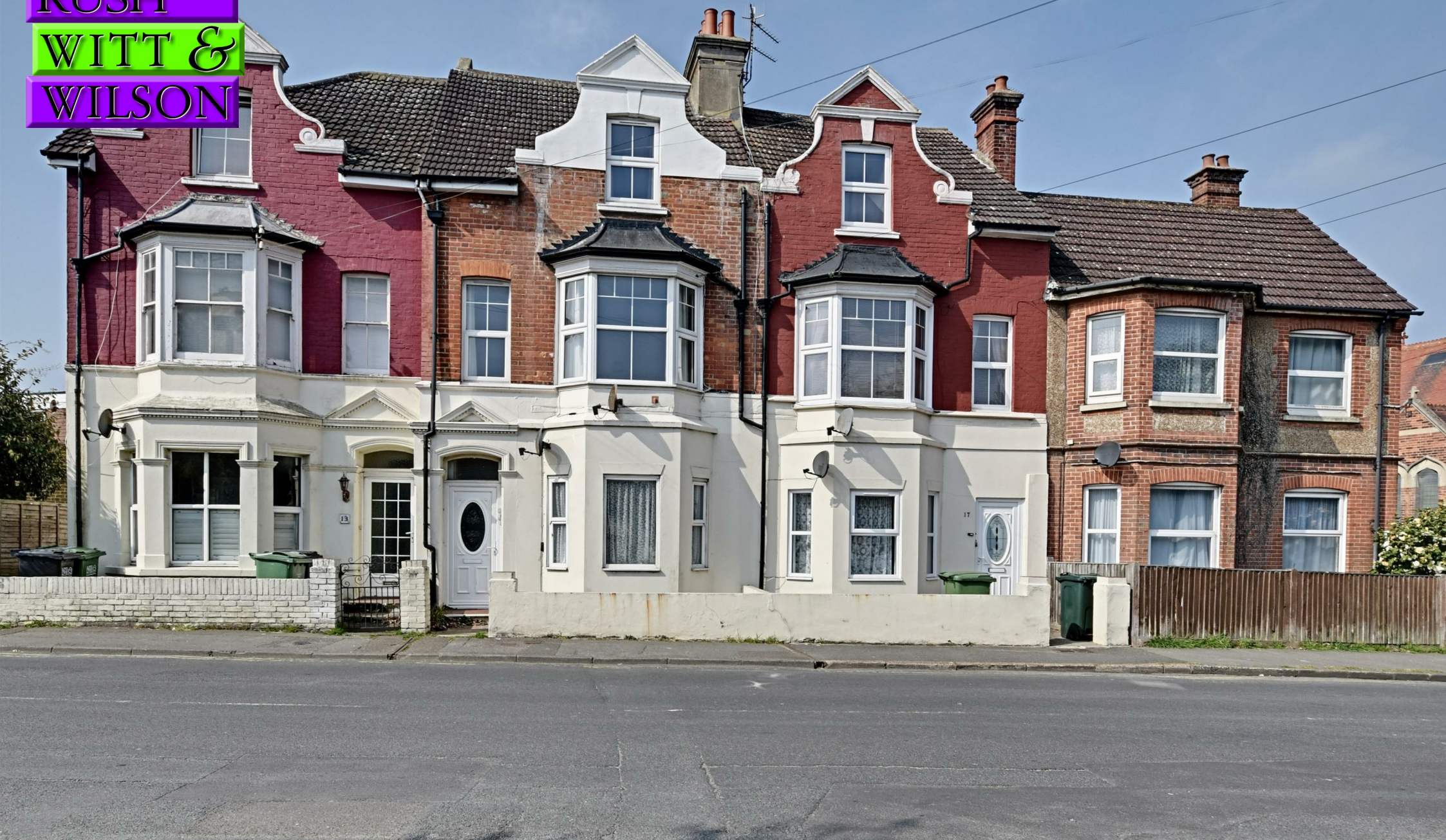
Flat B, 15 Holliers Hill, Bexhill-On-Sea, East Sussex TN40 2DY £195,000